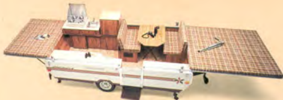
StarLite 24 SD