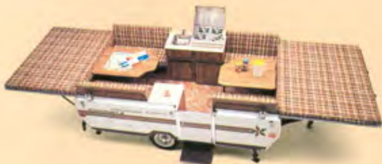
StarLite 21 TD