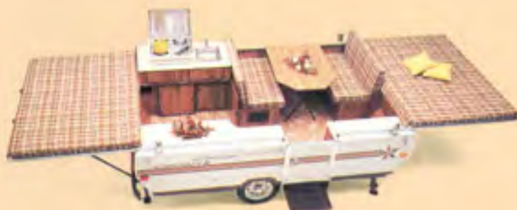
StarLite 21 SD