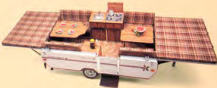
SLE 21 TD