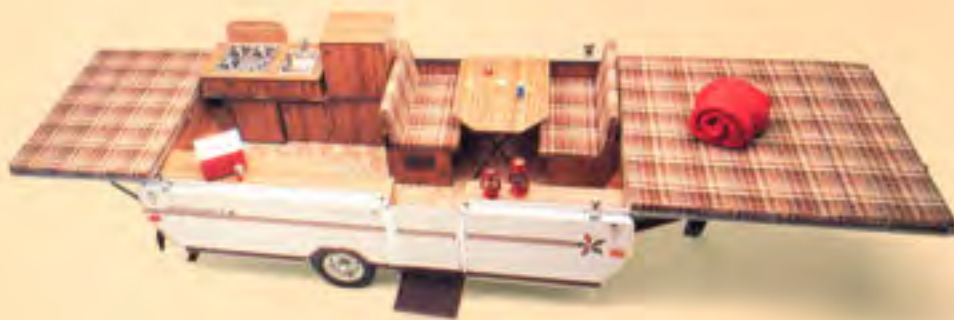
SLE 24 SD