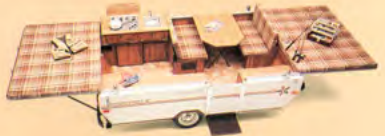
SLE 21 SD