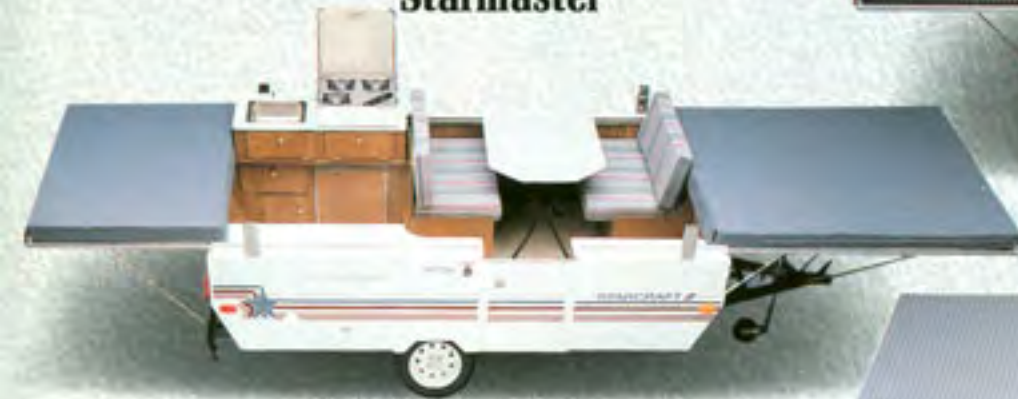
Starflyer and Spacestar*