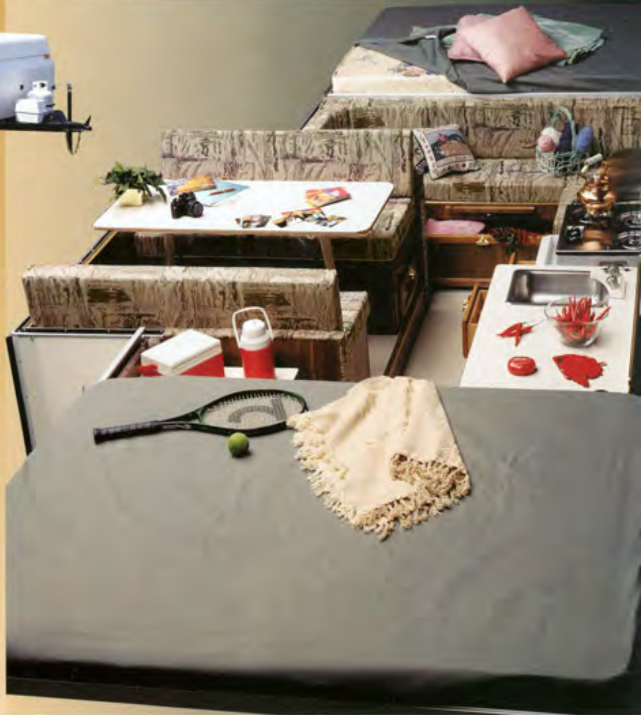
Dinette-in-a-drawer's slide out provides more room to stretch out and relax, while generous storage makes packing and traveling a breeze.

Our designers understand what camping families need. That's why you'll find so many handy features. Easy access storage, inside/outside cooking facilities, and comfortable sleeping accommodations all contribute to the good times you'll enjoy in your Flagstaff Dinette-in-a-drawer camper.