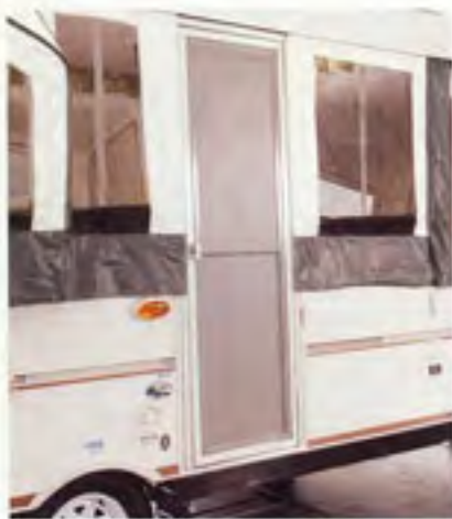
ONE-PIECE DOOR (EXCEPT LTD.)