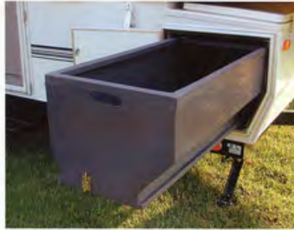
SLIDING STORAGE TRUNK (SOME MODELS)