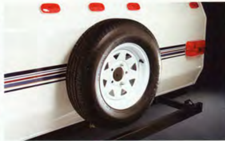
SPARE TIRE (OPT.)