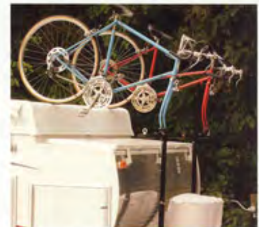
BIKE RACK (OPT.)