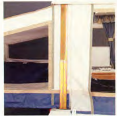
DOUBLE 3-STAGE LIFTER POST