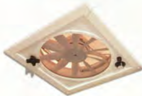
3-SPEED FAN (STD. OPT.)