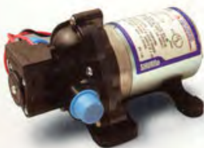
WATER PUMP (STD.)