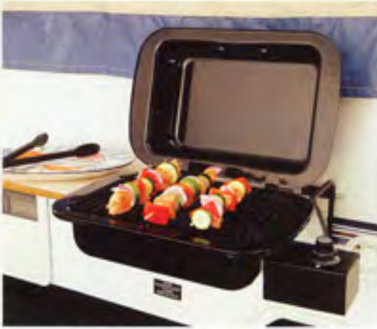
RVQ GRILL (STD. EXCEPT LTD.)