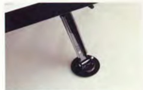
CRANK DOWN STABILIZER JACKS WITH SANDPADS (STD.)