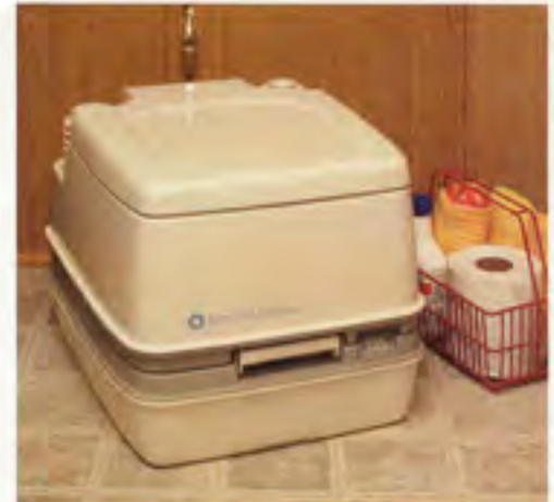
PORT-A-POTTY (SOME MODELS)