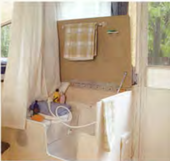
SHOWER (SOME MODELS)