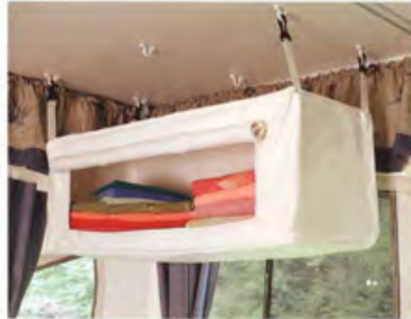
HANGING PANTRY (OPT.)