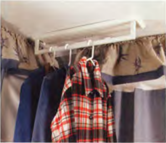
HANGING SHIRT BAR (STD. ON CLASSICS)