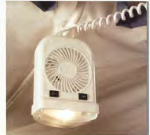
3-SPEED FAN WITH LIGHT (STD. WITH CLASSIC)