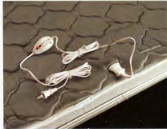
HEATED MATTRESS PADS (STD.OPT.)