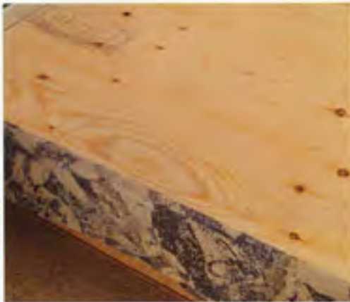
PLYWOOD BED END SUPPORT

A weekend away shouldn't be a weekend without comfort. Enjoy your favorite grilled meals. Take all the toys for the kids. There's plenty of room to keep it all.