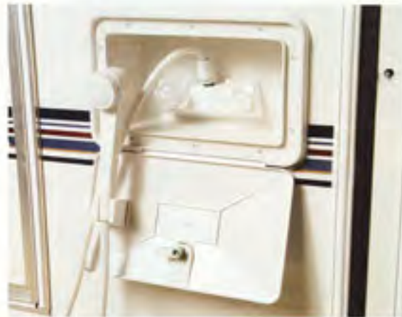
OUTSIDE SHOWER (ON SHOWER MODELS OPTIONAL WITH HOT WATER PACKAGE)