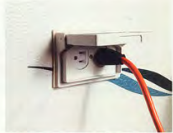
EXTERIOR ELECTRICAL PLUGS (EXCEPT 176 LTD)