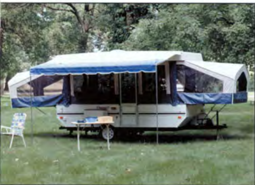
M.A.C. Model 228 Featured