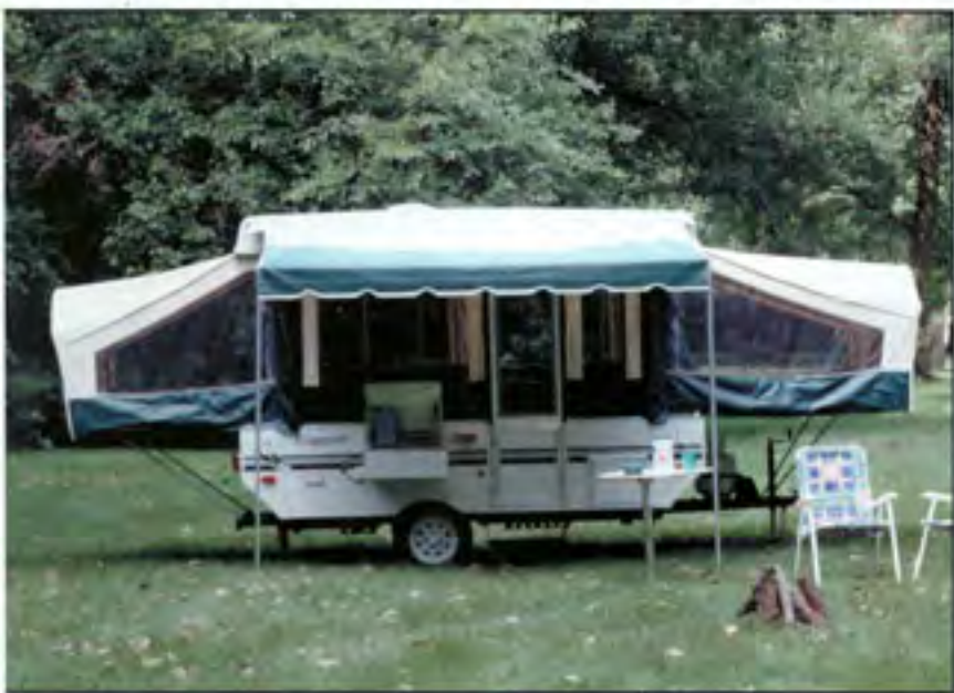
M.A.C. Classic Model 820 Featured